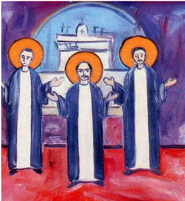
The Massabki Brothers (Three Maronite Martyrs)

NONPROFIT ORG U.S. POSTAGE PAID ST PAUL, MN PERMIT NO. 7606